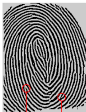
Figure 1: Minutiae 5

AFIS technology exploits some of these fingerprint features. Friction ridges do not always flow continuously throughout a pattern and often result in specific characteristics such as ending ridges, dividing ridges and dots, or other information. An AFIS is designed to interpret the flow of the overall ridges to assign a fingerprint classification and then extract the minutiae detail - a subset of the total amount of information available yet enough information to effectively search a large repository of fingerprints.